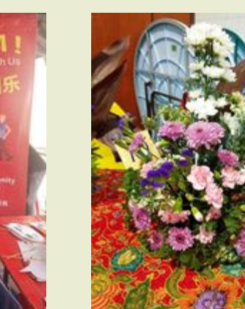
Flower arrangement by a sharp and healthy 75-year-old lady

As it is a disease that affects the brain's ability to generate signals and responses, in other words 'cognitive', any activity that can enhance brain function is said to help dementia patients. For retirees or those over the age of 65, it is recommended to always be active not only physically but also mentally. This group is advised to always think of ways to meet their daily schedule in addition to attending light leisure classes that can make one's time filled with thinking. Caring for dementia patients is a big challenge that not everyone is able to deal with. Therefore, it is recommended that the caregivers attend seminars or courses to strengthen their understanding on patient care and management. One of the early recognitions of dementia is when you start to forget your important daily routine which ends up in a repetitive cycle. A simple example is the misplacement of your car keys. If you often forget where your car keys are stored, whether it is hanging on the wall, in your handbag or in your pocket, then you have the early potential to suffer from dementia. So as a conclusion, always be alert of your important belongings, any repeated misplacement is an indication of an early stage of dementia.