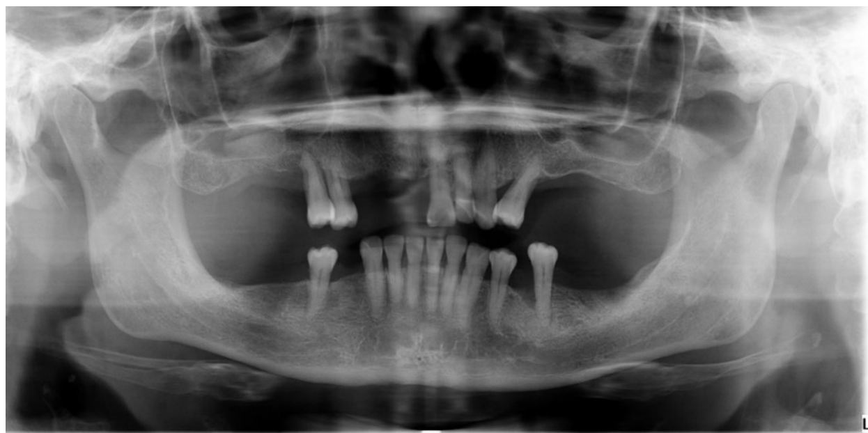
Figure 1. Baseline panoramic radiograph of the patient showing generalized horizontal bone loss and vertical bone loss on mesial root surface of lower left second premolar tooth

A 63-year-old Malay lady had undergone periodontal treatment at the Spinel Postgraduate Periodontics Clinic with her consent since November 2018 for management of residual deep periodontal pockets. She was diagnosed with Type 2 diabetes mellitus since 2015 and is currently on 1 g metformin twice daily. Full mouth periodontal examination revealed deep probing periodontal pocket depth (PPD) ranging from 5 mm to 8 mm with bleeding on probing (BOP). As shown in Figure 1, radiograph taken in November 2018 demonstrated periodontitis due to the presence of alveolar bone loss. Based on clinical examinations and radiographic investigation, she was diagnosed with Generalized Periodontitis, Stage IV, Grade C (Tonetti et al. 2018).