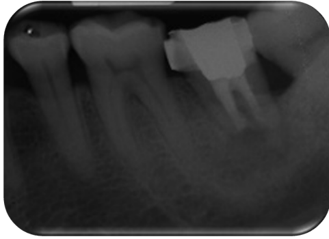
Fig. 7 Post-operative

mm or less and no mobility associated with the tooth. The condition of the tooth was considered good despite a guarded prognosis given earlier. Radiographically, healing was evident by a reduction in the size of the periapical lesion (Figure 8). The patient was advised to have a crown placed as soon as possible. The prognosis of tooth 37 was considered guarded, functional and favorable upon review.