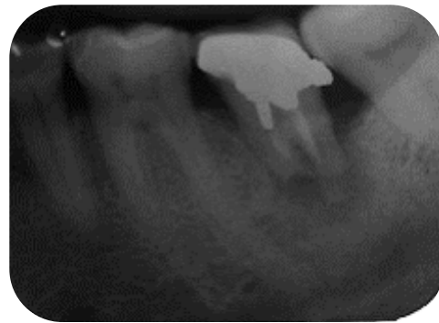
Fig. 4 Pre-operative radiograph of tooth 37 – one year after