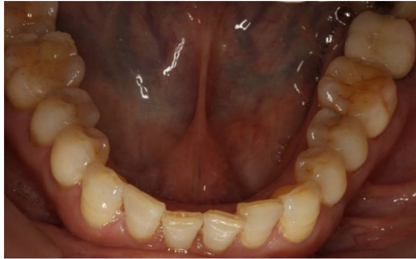
Fig.2 Clinical occlusal view of upper and lower arch

Periapical radiograph revealed a periapical radiolucent area associated end its root (Figure 3 and 4). The tooth had been treated five years before. These 37 apices were resorbed, probably a result of persistent apical periodontitis there. Widening of periodontal space was noted with this tooth 37. A diagnosis of chronic apical periodontitis with external resorption of root apices complicated with a C-shaped canal was made for the tooth 37. The patient was advised on the clinical findings and various treatment options were discussed including non-surgical root canal retreatment, no treatment at all or tooth extraction. All the technical challenges and potential risks of the procedure had been explained to the patient. She had given consent for the best potential method to preserve her tooth via a non-surgical root canal retreatment despite extraction. She persistently expressed the desire to maintain a functional tooth if possible without any extraction intervention. Due to the-nature of apical resorption, membrane barrier technique with Mineral Trioxide Aggregate (MTA) as the technique of obturation followed by a bonded amalgam core was recommended for this tooth.