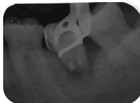
Fig.6 5-mm of MTA placement

Non-setting calcium hydroxide (Calasapt ® ) was used as intra-canal medicaments. All inter-appointment temporization was carried out with a cotton-pellet, Cavit ® (ESPE, Seefeld, Germany) and IRM ® (Intermediate Restorative Materials, Caulk.Co, Mildford, Del). Approximately 1 to 2 mm of IRM ® was placed over the root filling of all canals leaving about 1 to 2 mm space coronally for the radicular-bonded amalgam. The tooth 37 was restored with a bonded amalgam core and a post-operative radiograph was taken. Patient was advised to return to the referring dentist for further management of tooth 37. Upon completion of the non-surgical root canal retreatment, the prognosis of 37 was considered guarded (Figure 7).