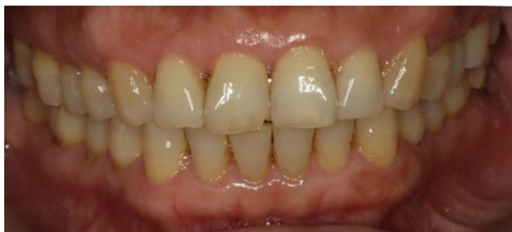
Fig.1 Clinical frontal view

The patient's oral hygiene was considered good with generalized mild deposit of plaque. All permanent teeth were present except tooth 28. There were generalized incisal and occlusal wear. Tooth 11 was chipped off at the incisal third (Figure 1). CMC was placed on tooth 37(Figure 2). Arrested caries were detected on occlusal of teeth 38 and 48. Periodontal probing in all teeth was 3 mm or less and normal mobility was detected in all teeth