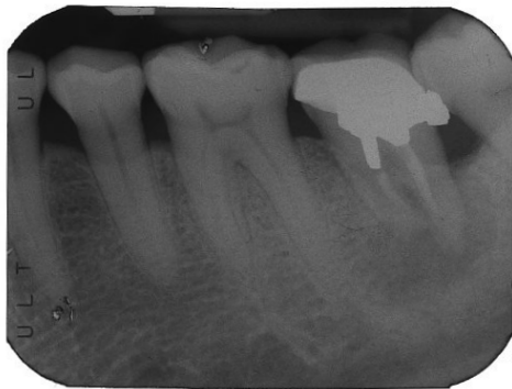
Fig. 3 Pre-operative radiograph- from referring dentist

Periapical radiograph revealed a periapical radiolucent area associated end its root (Figure 3 and 4). The tooth had been treated five years before. These 37 apices were resorbed, probably a result of persistent apical periodontitis there. Widening of periodontal space was noted with this tooth 37. A diagnosis of chronic apical periodontitis with external resorption of root apices complicated with a C-shaped canal was made for the tooth 37. The patient was advised on the clinical findings and various treatment options were discussed including non-surgical root canal retreatment, no treatment at all or tooth extraction. All the technical challenges and potential risks of the procedure had been explained to the patient. She had given consent for the best potential method to preserve her tooth via a non-surgical root canal retreatment despite extraction. She persistently expressed the desire to maintain a functional tooth if possible without any extraction intervention. Due to the-nature of apical resorption, membrane barrier technique with Mineral Trioxide Aggregate (MTA) as the technique of obturation followed by a bonded amalgam core was recommended for this tooth.