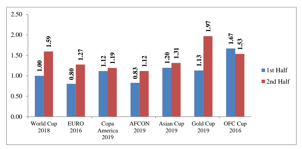
Figure 2: Goals per match between half according to tournament

Figure 2 shows the goal scoring per match at each half of all the competitions. The highest goal-scoring ratio per match for first half was OFC Cup 2016 with 1.67 goals per match. This is followed by Asian Cup 2019 (1.2 goals per match), Gold Cup 2019 (1.13 goals per match), Copa America 2019 (1.12 goals per match), World Cup 2018 (1 goal per match), AFCON 2019 (0.83 goal per match), and lastly EURO 2016 with 0.8 goal per match.