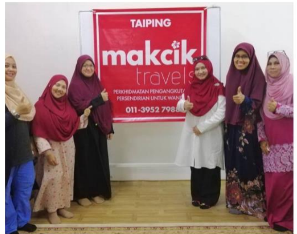
Figure 3: Agents of MakCik Travels