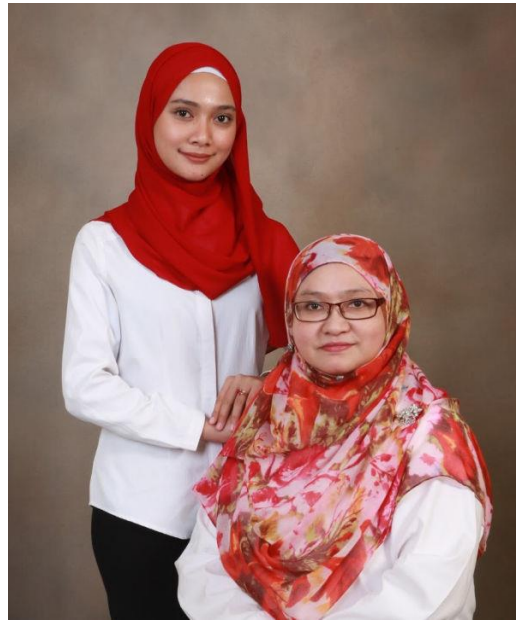
Figure 1: Founder of MakCik Travels