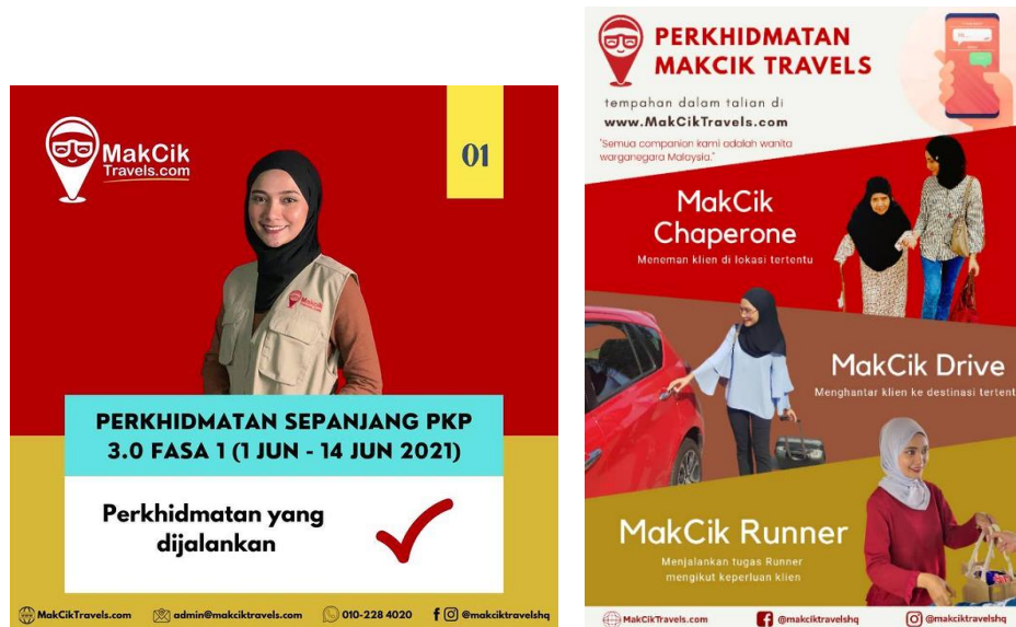
Figure 4: Services Offered by MakCik Travels