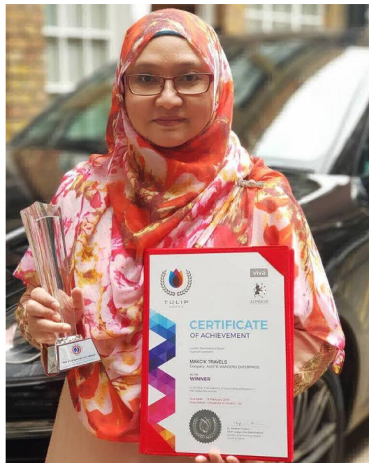
Figure 2: MakCik Travels's Award