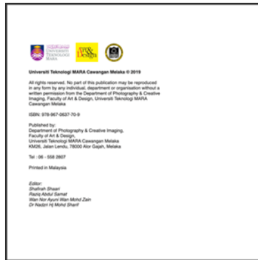
Figure 2. Copyright page and ISBN Number