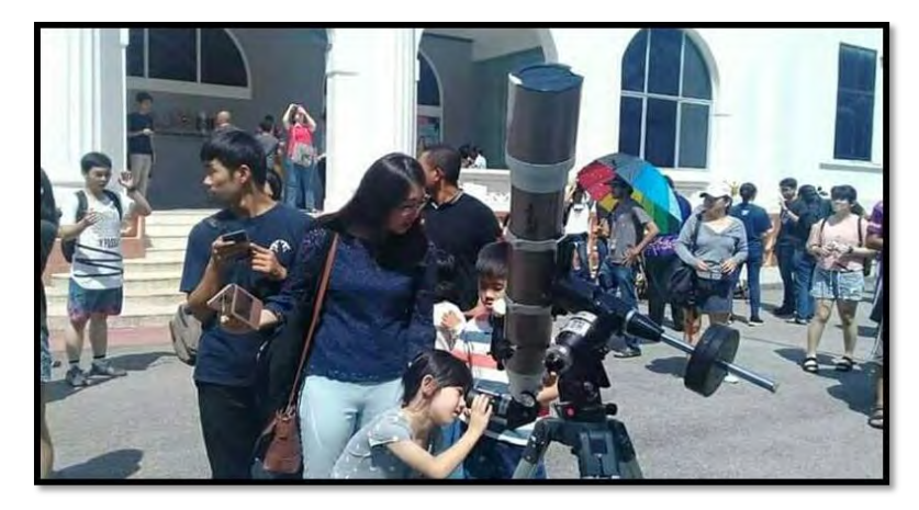
Figure 4. Visitors witnessing and observing a partial solar eclipse at MGTF, Universiti Sains Malaysia

experience enriched by science knowledge and appreciation of cultural arts and heritage in interactive, interesting with edutainment features.