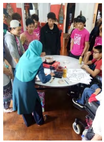
Figure 2. 'Batik' demonstration at MGTF-USM

The Asian Art Museum is the first university museum in Malaysia to offer services for students and the public regardless of race and religion where artefacts can be accessed for learning purposes (Wiessala, 2017). This prestigious university is also the only one in Malaysia that has a museum that exhibits artefacts consisting of three main civilizations of the World-Malay/Islamic society, China and India on display (Insight Guides, 2017). On the other hand, in Penang, Tuanku Fauziah Museum & Gallery (MGTF-USM) is the only museum in the region that combines both sciencetechnology and art-culture under one roof (Tan Li-Jen, 2012). The visiting experience at MGTF-USM provides holistic and stimulating principles of teaching and learning. Various programme involving the interaction between visitors and the museum staff, as well as the hands-on experience are very helpful to better understand the collections available at the museum.