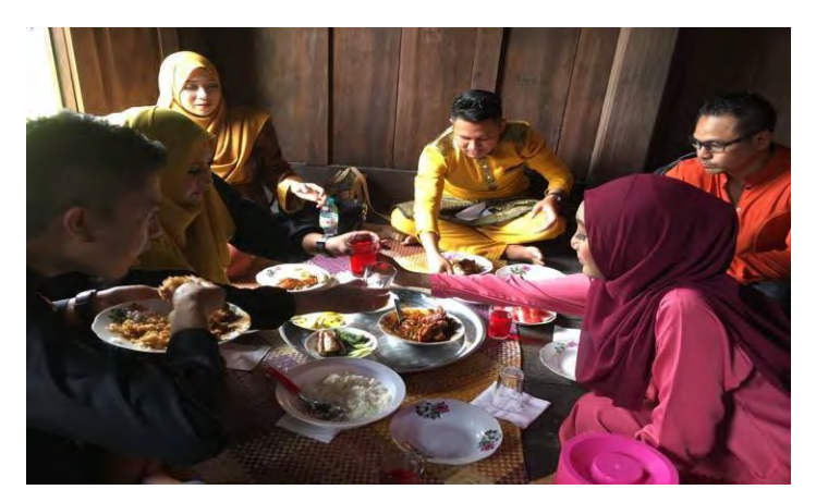
Figure 8. Unique services and activities provided at the Malay Heritage Museum, UPM

Thus, with a wide variety of exhibits and artifacts in the university museum, audiences can obtain new experiences and make their own meanings where, varieties of insightful ideas and perspectives can be created if perfect accompaniment and innovative thinking are applied to the participants. When the university museums are involved in social welfare program using educational materials linking to museums, each student will be able to develop innovative and creative thinking skills and relate to real-world abilities. Public projects and exhibitions are of great benefit to students in enhancing their skills, knowledge and acquiring new experiences related to specific interests such as culture, visual arts, professional sector and many more.