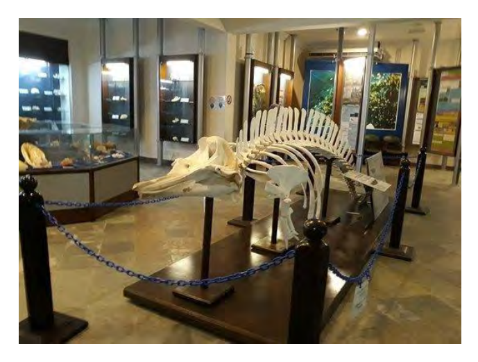
Figure 3. Collection of artefacts at the Aquarium and Marine Museum, Universiti Malaysia Sabah

Currently, both museums in the Universiti Malaya and Universiti Sains Malaysia are the most prominent, not only in the country, but also in Asia and other countries around the world. Almost every university museum and gallery in Malaysia plays a role as a centre for the collection, preservation, conservation, research, documentation, and exhibition of the country's cultural and scientific heritage. Besides that, most of the university museums and galleries in this country also offer great collections in an interesting and comfortable setting for the public to visit. For example, the Malay Heritage Museum (UPM) has several interesting collections including manuscripts, textiles, Malay weapons and many more. According to its curator, Nur Layla Witra Mat Arop (personal interview, April 5, 2020) visitors to this museum can also view and appreciate the 100-year-old traditional Malay houses representing various states in Malaysia.