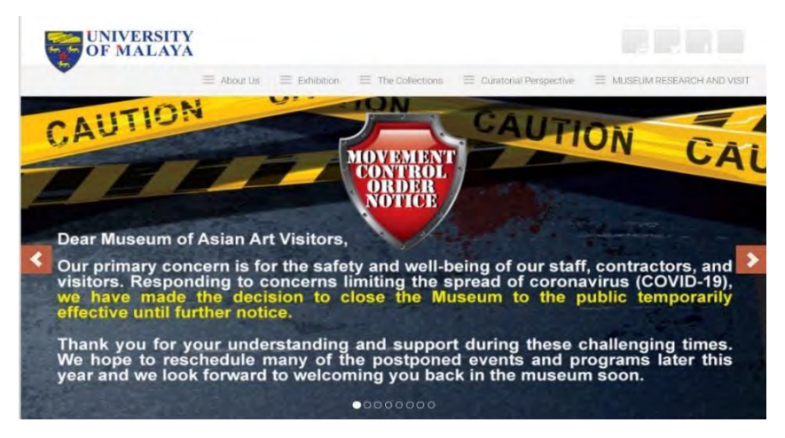
Figure 10. Official website of Asian Art Museum, Universiti Malaya

With the spread of Covid-19 over the past two years and the closure of several museums and university galleries due to safety factors to prevent the spread of the pandemic, a dramatic increase is now visible in the online community cultural visit to the museum's website. Many prominent museums around the world have adopted the digital ecosystem to introduce their respective museums. Malaysia is also no exception, although the number of museums that practice this is still in small numbers. This is due to the lack of expertise in this field, in addition to the need for considerable expenditure to implement it.