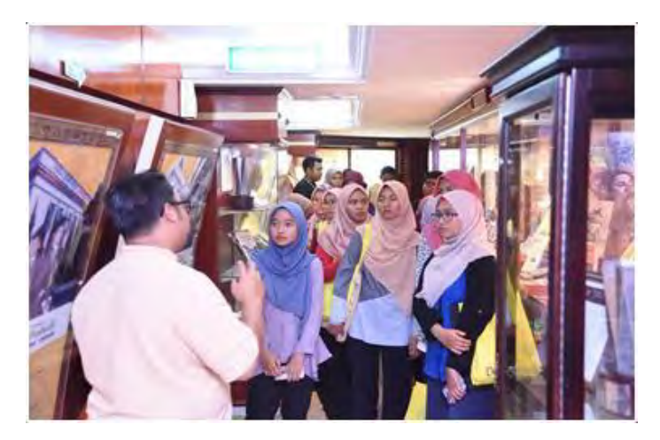
Figure 7. A brief briefing session on the exhibition at the Academic Heritage Museum, UKM by the staff to stimulate the minds of the visitors

Apart from developing skills, university museums in Malaysia play a role in enhancing one's skills and developing new concepts that can be implicit in life. Students are encouraged to experiment with their ideologies and understandings by applying critical, innovative and able-to-form critical out-of-the-box thinking. Therefore, these museums have their own distinctive characteristics, which provide audiences with a variety of informal learning opportunities. Several university museums are not open to the public due to several factors. Nevertheless, these museums still receive many visitors every month and get excellent feedback from students who agreed that they have learned new things after visiting these museums (Museos, 2018).