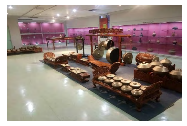
Figure 1. 'Gamelan' musical instrument collection at Asian Art Museum, Universiti Malaya

Civilisation (UIA). The collections exhibited in most Malaysian university museums are spectacular and have high historical significance.