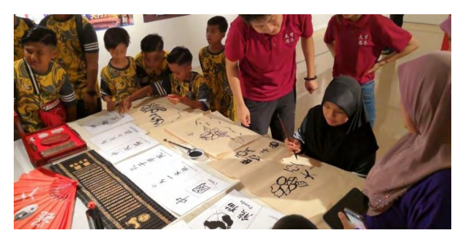
Figure 6. Activities for the development of skills by children at the Asian Art Museum, UM

When students visit the museum or bring some artifacts to the classroom for field work, the typical educational environments are instantly changing. This allows teachers and students to have the ability to engage in different settings with art objects.