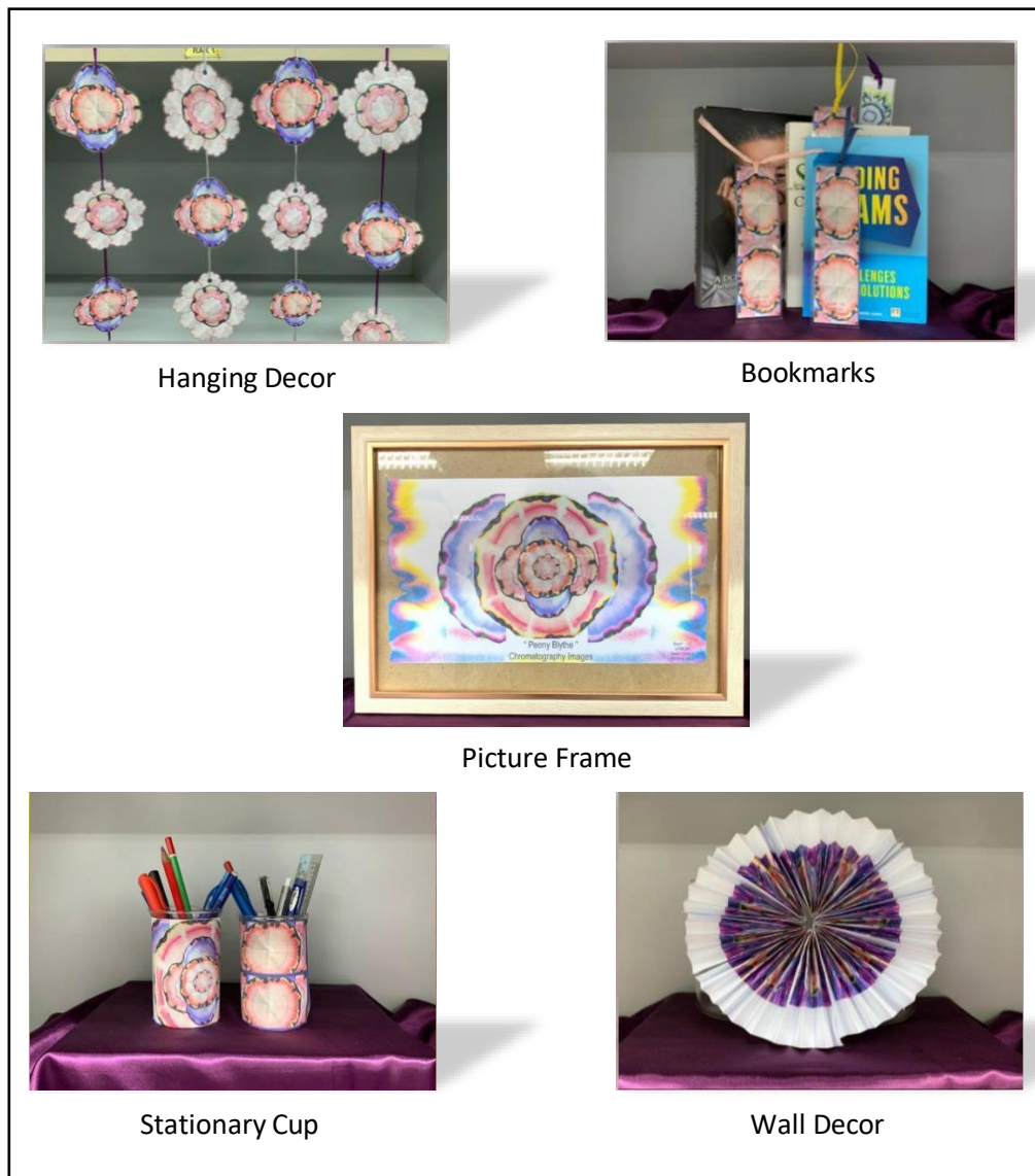
Figure 3. The several end products produced using art design and fiction chromatography filter paper