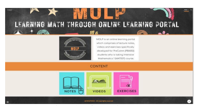
Figure 1: MOLP main page