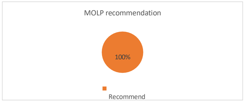
Figure 4: MOLP recommendation