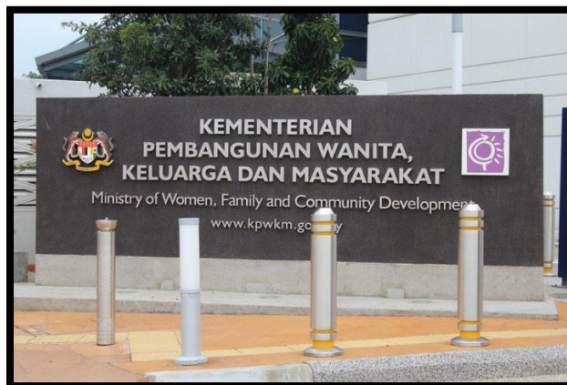
Photo 1.2: Signage of Ministry of Women, Family and Community Development Building

MINISTRY OF WOMAN, FAMILY & COMMUNITY DEVELOPMENT, 4G11, PUTRAJAYA