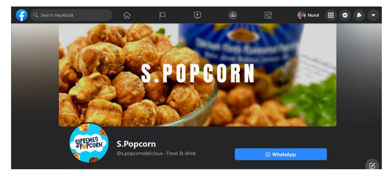
Figure 1: Name of Business