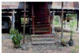
Pasu bunga / Flower pot Flower pots have been used down the ages yet to placed in the courtyard. Made of clay or plastic with various shapes and colours.