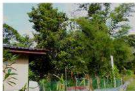
Pagar / Fence Fence is not a major element in the Malay landscape. The house compound of the Malay community in today's mostly having a fence; it was due to safety reasons.