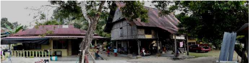
Figure 3: Modern house versus traditional house at Bota Kanan