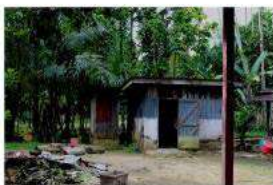
Tandas luar / Outside Toilet Bathrooms and toilet in accordance with customary the Malay community, need to be built outside the house with toilet. Toilets, showers and also an ablution place must be separated.