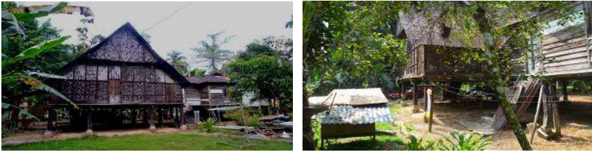
Figure 5: The old house that still maintains the traditional hard landscape at Parit