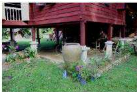
Tempayan / Water vessel For the Malay community, water vessel usually made without carving and used for storing water and fermenting foods.