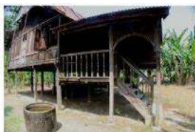
Perigi / Well Wells is a hole dug to obtain water resources (groundwater). It can be as simple as a hole, allowing a bucket on a rope lowered into, or very complex, using high-powered pipes and pumps to bring water.