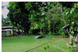
Ampaian / Suspension It is a place to hang washed clothes.