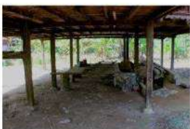
Pangkin / Resting hut Resting hut is a four-legged wooden building, or more (depending on size) and slightly lower than that table. The significant difference between the resting huts with this platform is, in terms of its size and its location.