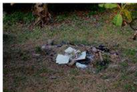
Perun / Dump site Perun is a hole dug, the location is in the back of the Malay house, and be a place to dump and burn rubbish.

Through the observation by the researchers, hard landscape and its functions are not the same from one sample to another sample.