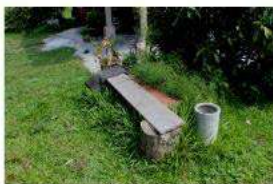
Kerusi / Bench Seating in the compound which intended to leisure activities.