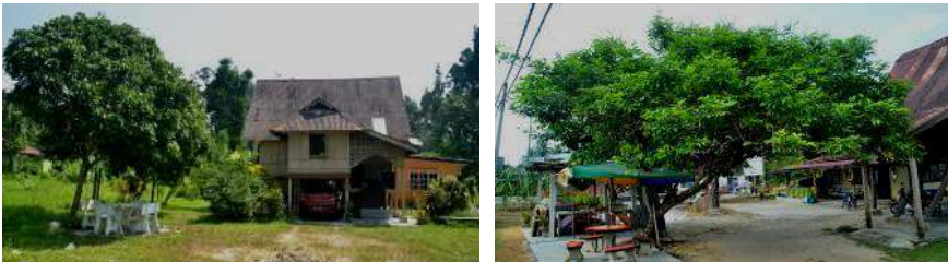
Figure 4: The old house styled with modern landscape features at Bota Kanan