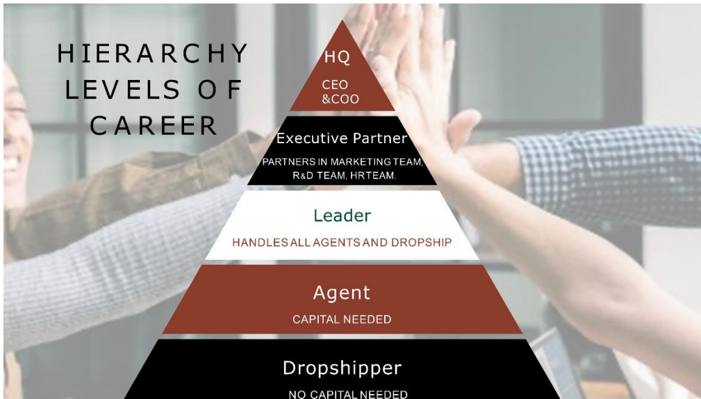
b) Hierarchy Levels of Career