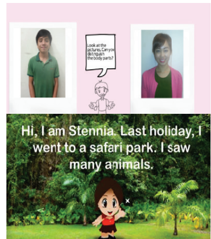
Figure 2: Examples of Digital Materials Developed