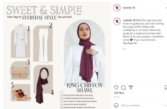
Figure 4. Creative Advertising Post by Naelofar Hijab Brand

Brand advertisements on Instagram Naelofar Hijab are evaluated using the AIDA model. This strategy is applied to the Naelofar Hijab Brand to examine ten successful campaigns utilizing an Instagram marketing tool to drive audience traffic to the brand effectively. The AIDA Model, which is hierarchical, explains how Instagram followers are directed toward making purchases related to the Brand's interest. The AIDA model, which is order-based, depicts how Instagram followers make purchases from a business. As a result, the process increases followers' contact with the Brand and elicits emotions, resulting in a more fulfilling and enjoyable brand experience. The experience may result in creating a new target audience based on feedback.