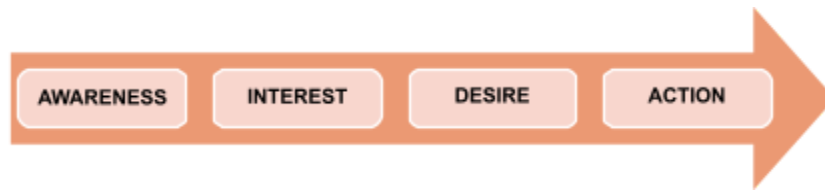
Figure 1. AIDA model