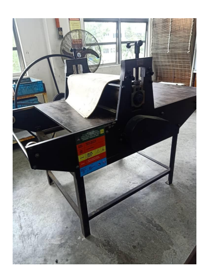
Figure 9. Etching Press Machine used in the conventional process of a Drypoint print.