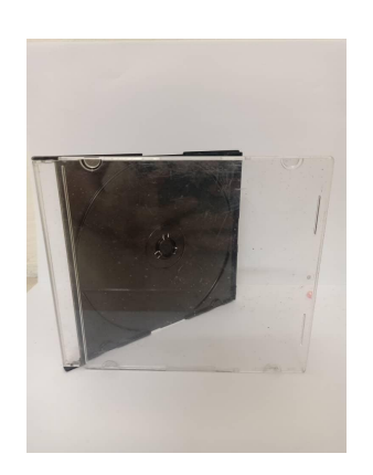
Figure 3. Alternative Plate (Plexiglass / Acrylic Sheet and CD cover)