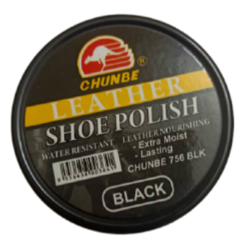
Figure 8. Shoe Polish as Alternative Ink