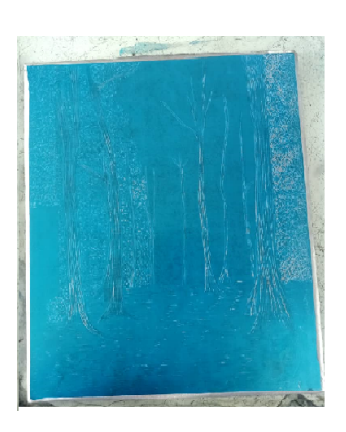
Figure 2. Copperplate and Zinc plate for conventional Drypoint printmaking technique