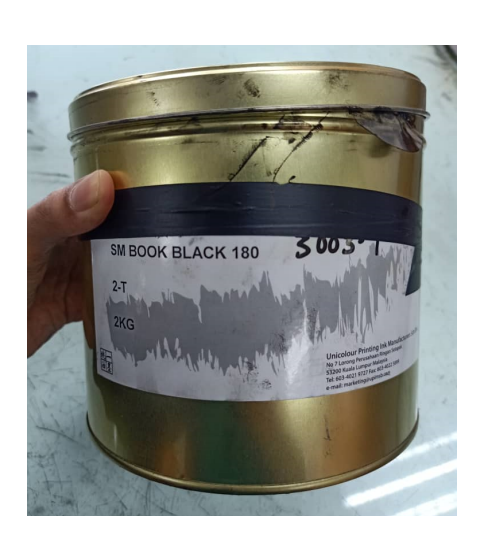
Figure 6. Off-set Ink (Slow-dry) is used in the conventional process of a Drypoint print.