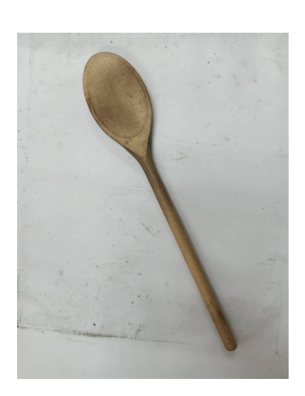
Figure 10. Wooden Spoon.