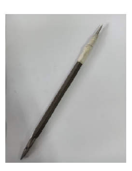
Figure 4. Scribe or Drypoint Needle for conventional Drypoint printmaking technique