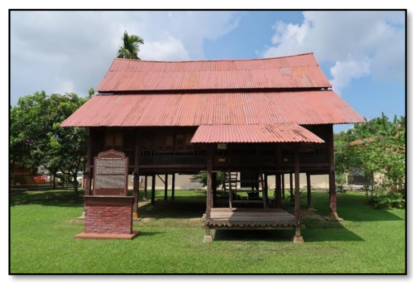
Figure 1. House No 1