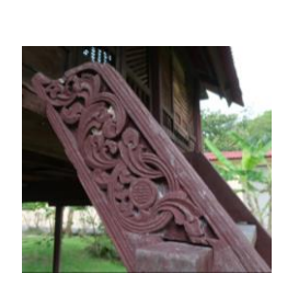
J: motif bayam , geometry (circle) & fauna (scales)