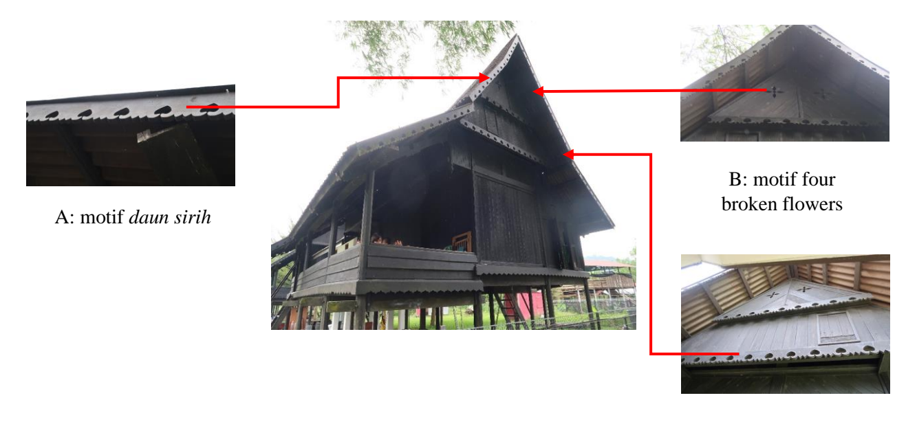
C: motif daun sirih