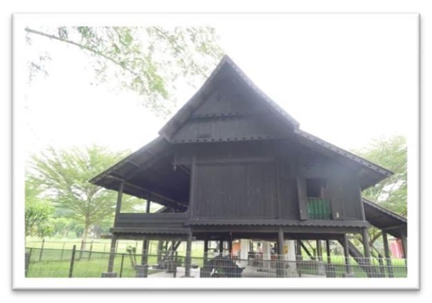
Figure 5. Motifs on House No 2