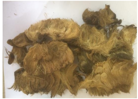
Fig. 1: Dried areca nut

Next, the chemical composition was investigated using energy dispersive X-ray (EDX) spectrometer, one of SEM further. EDX have an electron-excited characteristic X-ray peaks that provide identification and quantification for all elements of the periodic table,