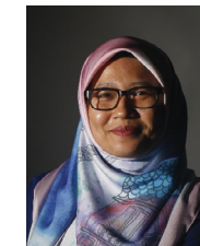
IZZA KARIM Imagination

This artwork is meant to express recognition of Autism in overcoming their challenges by learning through play and to promote and recognize toy building bricks as an important supporting tool for learning and strengthening their skills and abilities.