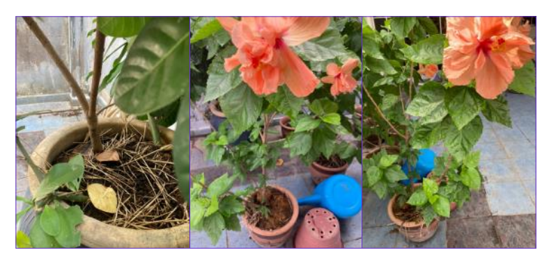
Healthy plants in the writer's garden, ... Thanks to Rabbit Poop!