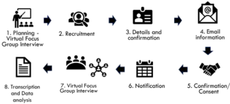
Figure 2 Steps for Conducting the Virtual Focus Group Interview