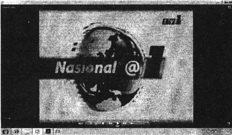
Figure 1: Video on urban poverty in Kuala Lumpur, Malaysia