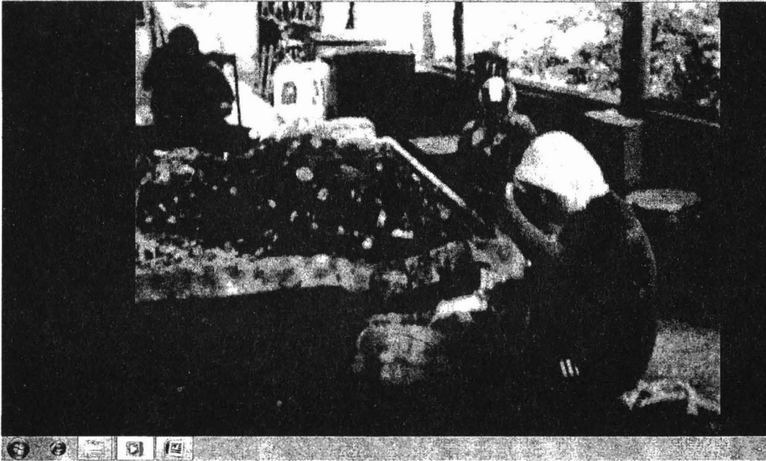
Figure 3: Students' group assignment on Small and Medium Industries (SMIs) in Malaysia

Nevertheless, there were some constraints faced by the lecturer when using video clips in the classroom. One of the major constraints in UiTM Pahang was there were only certain classrooms that provide technology equipment. These classrooms are known as TEC or semi-TEC rooms. The major constraint that could make the use of video fail in class was when the classroom did not provide any technology equipment such as computers and video projectors (LCD) or the technology equipment available in the classrooms was broken. This could disrupt the teaching and learning processes in the classroom. Thus, the lecturer had to take her own initiative to get her own video projector and bring a laptop, projector and speaker to class for every lesson. Besides that, some of the videos shown to the students were in the Malay version as it was quite hard for the lecturer to obtain the appropriate videos in the English version from the suggested website. The students therefore had to translate the points from Malay to English. In addition, the quality of the sound of the video sometimes was not good as the students could not listen clearly to the speech.