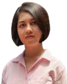
ARTJAMILA Standing in Solidarity, Series 2

“Art is my voice, and it is poetry on canvas that acts as the mirror to my soul,” by Artjamila