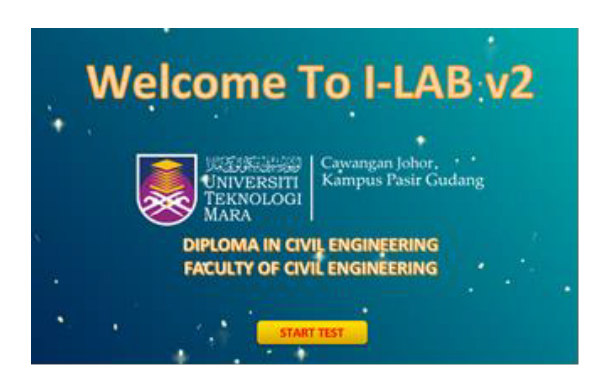
Figure 1. Interface of i-LAB v2

i-LAB v2 consists of an excel template that provides all the information regarding the course which is Water Engineering Laboratory. The information includes the laboratory manual, apparatus needed for the experiment, video of the laboratory procedures and a section for students to prepare their laboratory report. Once they finish writing their report using i-LAB v2, they can save and convert their report into pdf format and send the report to the lecturer in softcopy form or students can print out the pdf format to submit the report in hardcopy. Figure 1 shows the first interface of the template. Students can use this template by hitting the 'Start Test' button.