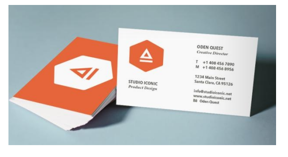
Examples of Business card Design

Our company, RulFar_23 is a services and product that making a business card for company employees. Our products that is business card that making by template and design from customers want.