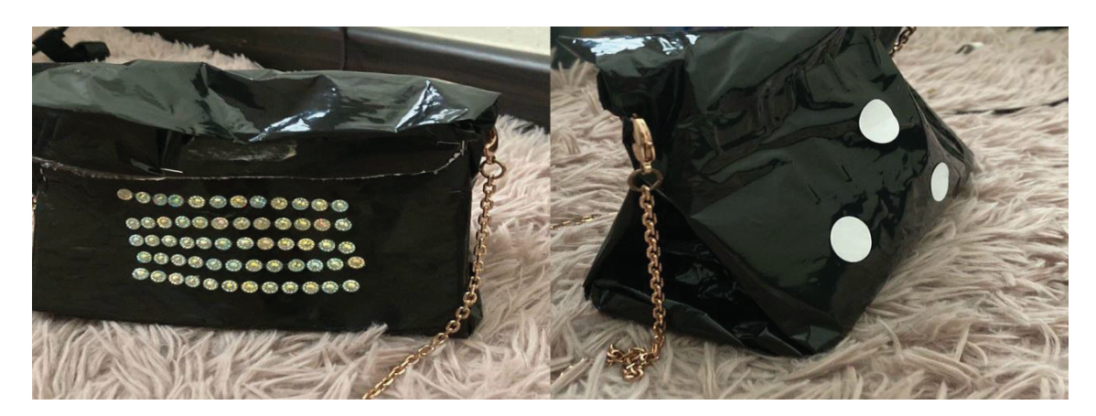
Design 2 - The next travel pouch is designated for girls or women. This is because our second design has beautiful beads that can attract customers, especially women to use our travel pouch. It is not only attractive but also environmentally friendly. In addition, our second design of travel pouch is suitable for various events because it looks glamorous even though it is made from used materials. Other than that, this product is sold at a reasonable and affordable price to ensure that all users can use our travel pouch. It also can fit several items such as car keys, cardholders, and mobile phones.