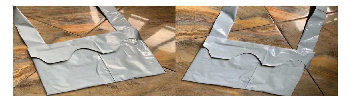
Design 1 - As for our first design of travel pouch, we focus on those who love to carry a sling bag as it is user-friendly and suitable to be used anywhere. It is specifically designated for placing personal items such as mobile phones and small wallets. In addition, our first design also included a small compartment that can be used to place coins. The advantage of this first design is that it is waterproof. Therefore, if the user is a tough person, then it will protect the user's items from being exposed to water.