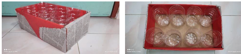
Figure 3. Sample STATIONARY ORGANIZER

STATIONARY ORGANIZER is introducing a recyclable and affordable product to the public in ways to save the environment. It has been introduced publicly as one of the 'd.i.y' or known as 'do it yourself' products. STATIONARY ORGANIZER is producible due to resources that can be obtained from daily life. This product can be used by different ages of people from kids to adults as an organizer for stationery items. STATIONARY ORGANIZER can be used to store stationeries such as scissors, rulers, markers, and pens. Figure 3 displays the product of the STATIONARY ORGANIZER.