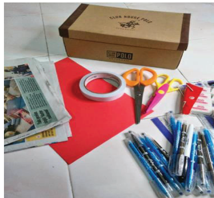
Figure 1. Material Used

As our group has been thinking of creating a stationery organizer made using recycled materials. Therefore, the material that we used are newspapers, colour paper, shoe box, water bottles, double tape, stationery, and scissors.