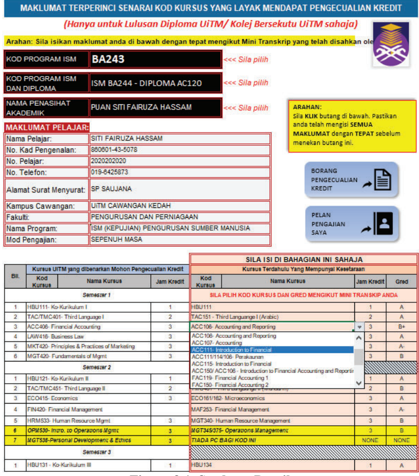
Figure 3.1. Students Details