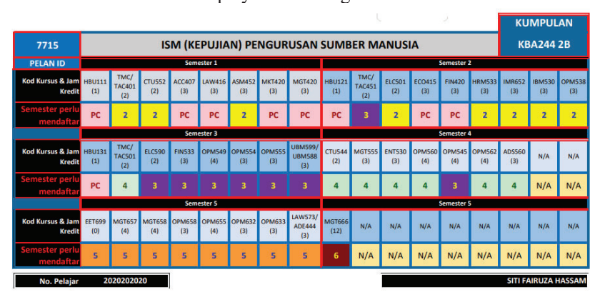
Figure 3.3. Program Structure for each Semester

The next objective of this system is to be able to channel information and display the study plan along with the course code that needs to be registered for each semester. This display is guided by the information of the graduate program that has been taken by the student. Based on the database information that has been integrated with the original study plan, CEMS will continue to display all the course codes that need to be registered each semester as well as the groups that need to be registered by students. Figure 3.3 show the CEMS Display for the Program Structure for the whole semester.