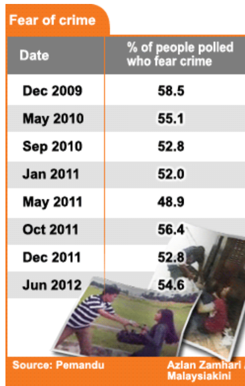
Table 3: Fear of Crime

Source: Pemandu (as reported in Malaysiakini, 24 th July 2012, Why Police Are Impotent in Dealing with Growing Crime)