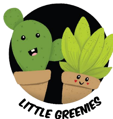
Little Greenies logo

The name of the company, Little Greenies, is a representation of little cactuses and succulents. The combination of the words 'little' and 'greenies' indicate that there are many 'little' plants, sold by us. This company is based in Puncak Jalil, Selangor.