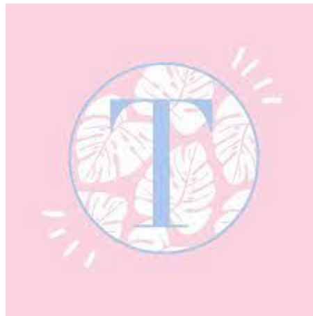
Figure 1.1 Temyracle Hq Official Logo