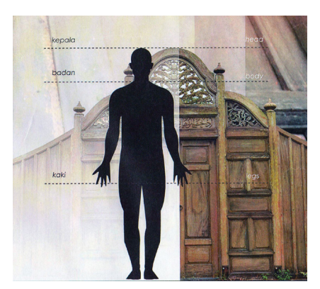
Figure 2.7: The metaphor of human anatomy at the portal (National Museum,2012)