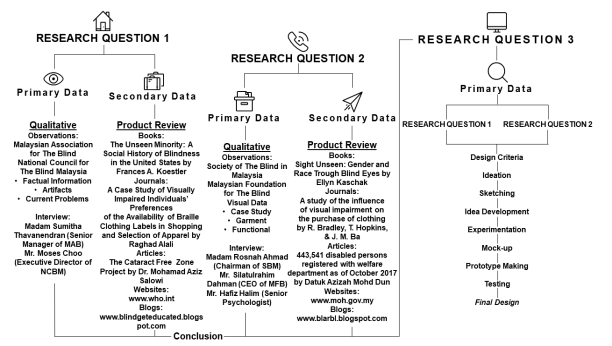
Figure 4: Research design of the study (Khairi Karim, 2020).

Through this descriptive method, relies on data collection to interpret the results of the interview. The selection of this method is because the data collection process is easier to understand by interpreting facts. It is also easier to analyzed and explain.