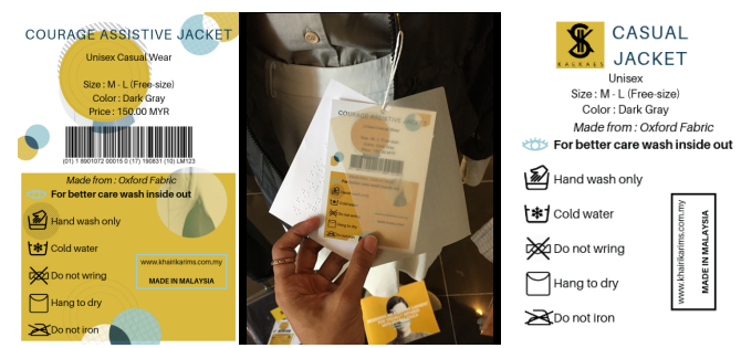
Figure 5: Braille tag with the information of size, price and care label (Khairi Karim, 2020).

The purpose of this study is to assist the visually impaired group to undergo daily activities related to clothing to facilitate the process of wearing clothes, how to identify clothes and activities to buy clothes. Perhaps this study still maintains the manual method but it is still relevant to use. In addition, it remains closely related to the latest technology in its manufacturing process.