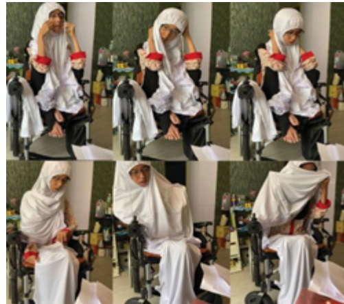
Figure 1. Respondent shows a tutorial on wearing prayer attire on a wheelchair