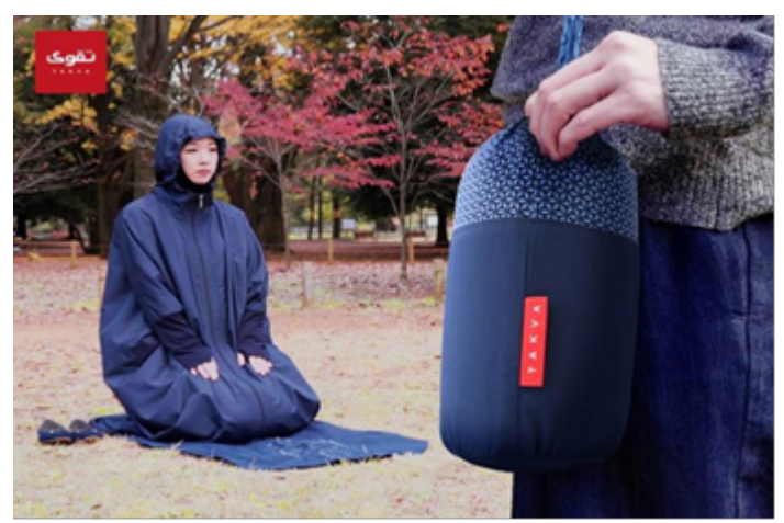
Figure 2. he versatile prayer attire for travel by Prayer Parka.

A variety of functional clothing products are available in the market such as protective clothing, medical clothing or sports clothing, even though little information is available regarding the principles employed in these products. The multifunctional garment arose to fill some wanted requirements in the new lifestyles and "many designers of super modern clothing have adopted a modular system of dressing in an attempt to simplify the complexities and unify the discontinuities of life (Morais, 2015). The design research has to attend with product multifunctional ability includes adjustable, mobility, donning and doffing, safety and flexibility. Functional considerations are concerned with a product's ability to perform the tasks required by the user. While functional clothes specially designed for people with disabilities can benefit other people too. For example, in figure 2, the existing brands which are making multifunctional Muslim prayer attire based on user's needs.