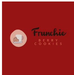
Figure 2.1 Company Logo

Frunchie Cookies is a business name for our main product that includes cookies and crunchy. Frunchie Cookies is categorised as a sweet dessert based product because it is served with extra dried berries on top, made with variety of chocolate as a base and it can be enjoyed during leisure time. Our motto or slogan is “A Frunchie A day, Keep the Stress Away” that shows our product can be your stress reliever. For the target market, our product can be consumed by everyone, no matter how old or how young a person is. It is due to low level of sweetness of our Frunchie Cookies.