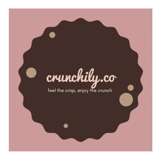
FIGURE 1: LOGO OF CRUNCHILY.CO

This business's name is Crunchily.co and it is located at No. 20, Jalan Dataran Wangsa Melawati, Wangsa Maju, Setapak, 53300, Kuala Lumpur. The business name has been decided as our main product is from Mouthgasm Crunchy, which is a sort of chocolate jar with cookies crumbs in it. This completed the idea of the business's name because the ingredients in the chocolate jar is crunchy and delicious.