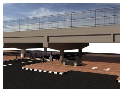
Figure3: Proposed design in Kuala Lumpur

Based on questionnaire distributed in Penang, a sports activity is chosen to be developed at BKE Flyover after considerations of the size and location of spaces (Figure 1). In Johor Bahru, a restaurant and café has been chosen to be developed at Lingkar Dalam Flyover (Jalan Wadi Hana). The location is suitable because it already has parking spaces and not connected to the main road (Figure 2). As for Kuala Lumpur, most of the flyovers are already used as parking spaces. So, we are choosing SBE Flyover (Jalan Pandan Indah 7) to be developed into proper parking spaces that follow rules and regulations (Figure 3).