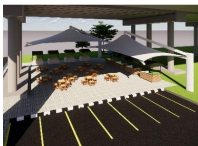
Figure 2: Proposed design in Johor