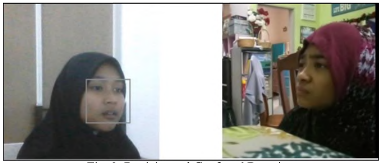
Fig. 2. Participants' Confused Reactions