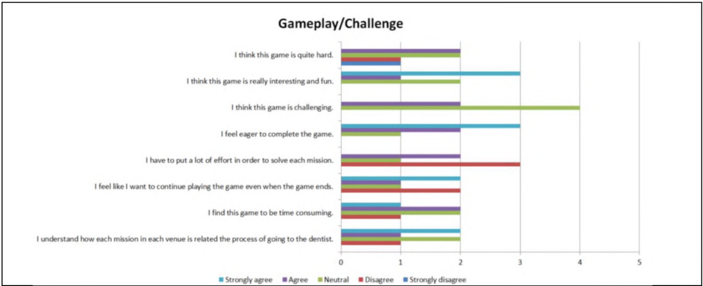
Fig. 3. Result of Gameplay/Challenge Section

Fig. 3 shows the result of the gameplay/challenge section. Based on the result, most of the questions ask for this section received balanced feedback. This might be because of the balanced distribution between children who often play games and those who rarely play games.