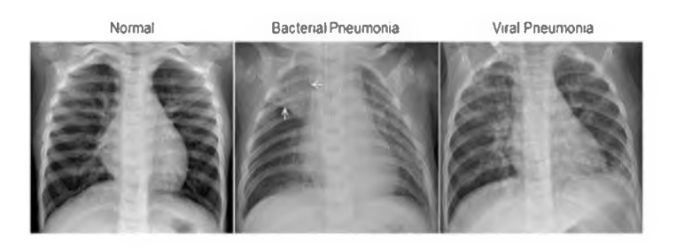
Fig. 1. Images of Normal and Pneumonia Type

The experiment is using the image processing technique, thus image datasets are collected. The X-ray images were used for detection and gathered from the Kaggle dataset. The total of images taken is about 150 images with every class collected for 50 images accordingly, the normal, viral pneumonia and bacterial pneumonia images. However, during the process, the images are then separated for the training and testing with a ratio of 80:20.