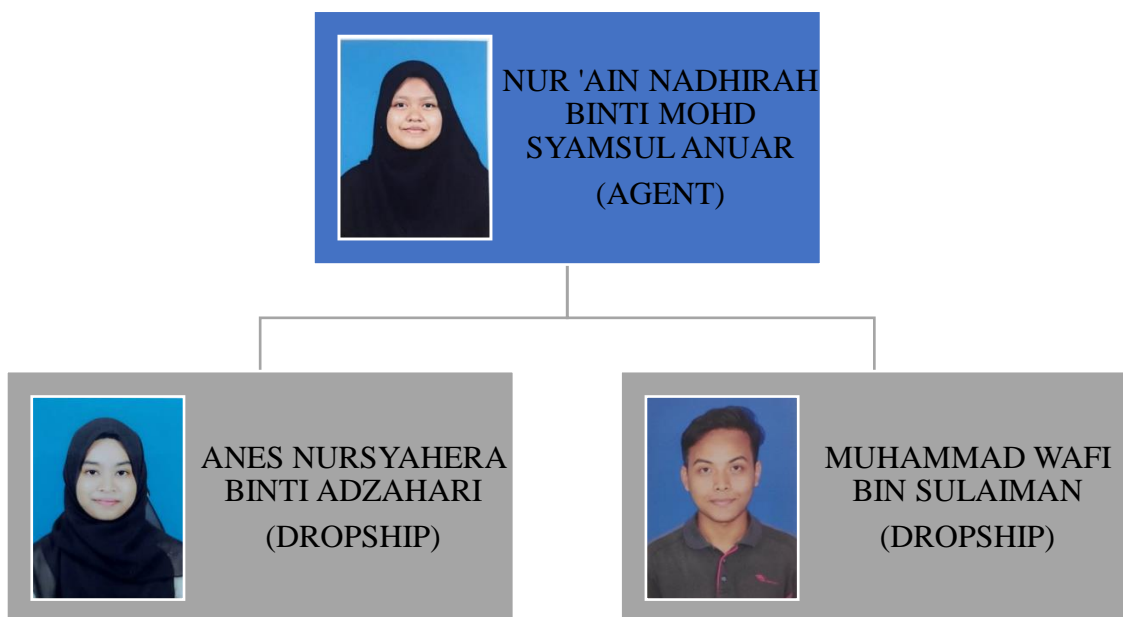
Chart 1: Mamasabya Organization Chart

This is my business organization chart that include my two dropships under me.