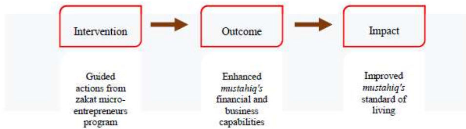
Figure 2: The best FMP framework