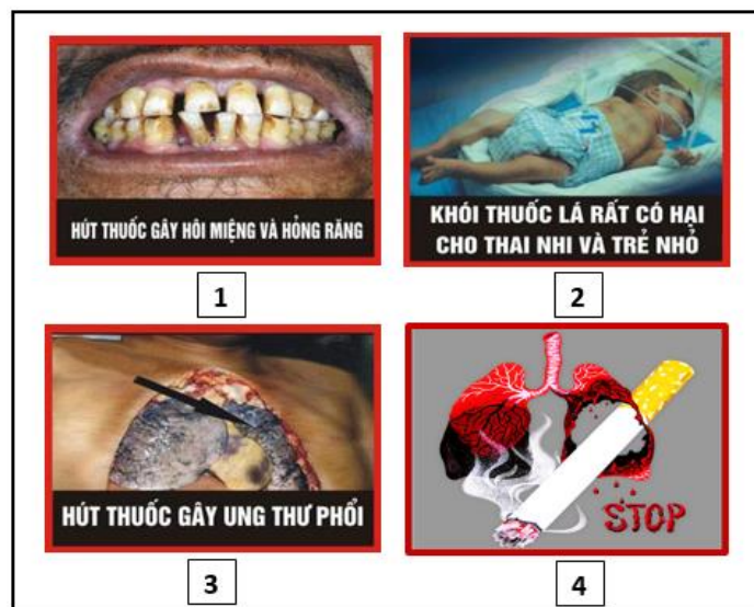
Figure 1: Graphic images were used in choice experiment

The choice experiment (CE) method was used to capture the potential impacts of warning information on smoking control policies. The CE technique was first developed by Louviere and Hensher (1982), then applied widely in many fields such as marketing, transportation and tourism (Carson et al. , 1995; Morrison et al. , 1997). CE technique is based on Random Utility Theory of Lancaster, wherein individuals are asked to make a number of choices among products or services. Each product or service is defined by their attributes at different levels (Lancaster, 1996). From April 2018 to June 2018, a choice experiment (CE) was conducted in Can Tho city – the largest city in the Vietnamese Mekong Delta. We performed a choice experiment among 120 adult smokers surveyed using questionnaires. In this study, product attributes and their corresponding levels (see Table 1) were selected based on the basis of a literature review (Goto et al. , 2011; Czoli et al. , 2017; Regmi et al. , 2017).