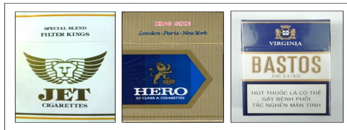
Figure 4: Images of top three most popular cigarette brands