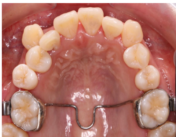
Figure 1: TPA was cemented on the maxillary first permanent molars

For those who received a TPA, molar bands (3M Unitek™ Narrow Contoured Molar Bands, California) were fitted on both the first permanent maxillary molars a week after separation. Upper alginate impression (Kromopan, Lascod, Italy) was taken over the bands and sent to the laboratory for casting and fabrication of the TPA. A technician (SH) was assigned to fabricate the TPA, which was made from a 1.0 mm stainless steel (SS) wire soldered to the palatal surface of molar bands with a U-loop facing posteriorly and it was placed 2.0 mm away from the palatal vault ( Figure 1 ). It was cemented using a glass ionomer luting cement (GC Fuji 1, Japan) a week later.