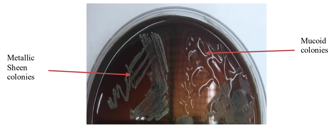
Figure 1. Pseudomonas aeruginosa colonies growth on blood agar