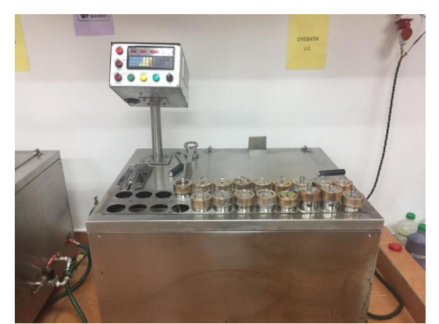
Figure 3. Exhaustion dyeing machine