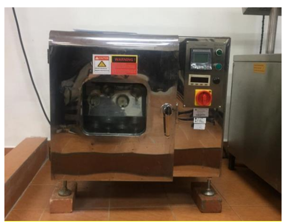
Figure 4. Infrared dyeing machine

Approximately 5g of pineapple leaf fibres were soaked in a dye pot containing 1:20 (fibre ratio to dye liquor) stock solution ratio. MX Basic Red 310N 11b Procion MX reactive dye in red colour was used to dye the fibres. The dyeing process was carried out using a laboratory infrared dyeing machine (Figure 4). Sodium hydroxide (60 g/L) and sodium carbonate (20 g/L) were also added as part of the dyeing mixture. The temperature of dyebath was steadily increased up to 90°C for 60 mins throughout the process. The temperature was constant in 90°C while the dye pot was rotated at 45 rpm for the designated shade depth. The dyeing concentration was constantly observed at 1.0% shade depth. Finally, the samples were air-dried and assessed for colourfastness properties to washing.