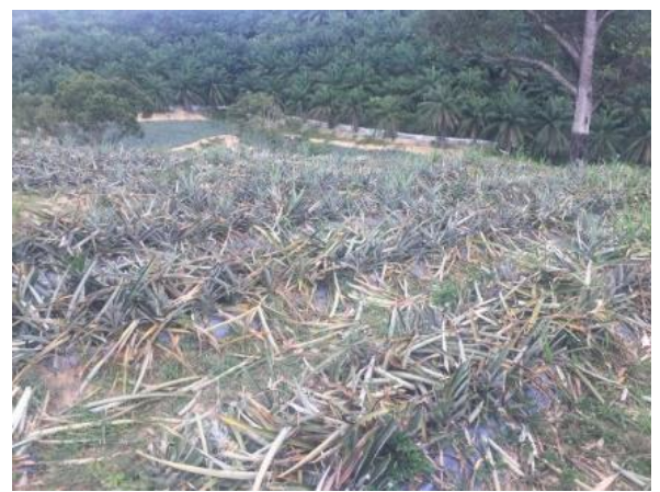
Figure 1. Seri Menanti Valley Farm

The extraction process was conducted using a mechanical extraction method to remove the waxy layer as shown in Figure 2. Rubber mallet was used for crushing the waxy layer on pineapple leaves. Then, scrapping tool was used to completely scratched the waxy layer leaving its fibres exposed beneath the pineapple leaf. Combing was performed after the oven-drying process to separate the fibres into single fibre.