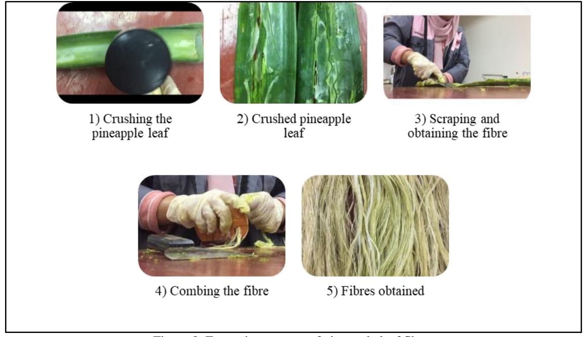
Figure 2. Extraction process of pineapple leaf fibres

The extraction process was conducted using a mechanical extraction method to remove the waxy layer as shown in Figure 2. Rubber mallet was used for crushing the waxy layer on pineapple leaves. Then, scrapping tool was used to completely scratched the waxy layer leaving its fibres exposed beneath the pineapple leaf. Combing was performed after the oven-drying process to separate the fibres into single fibre.