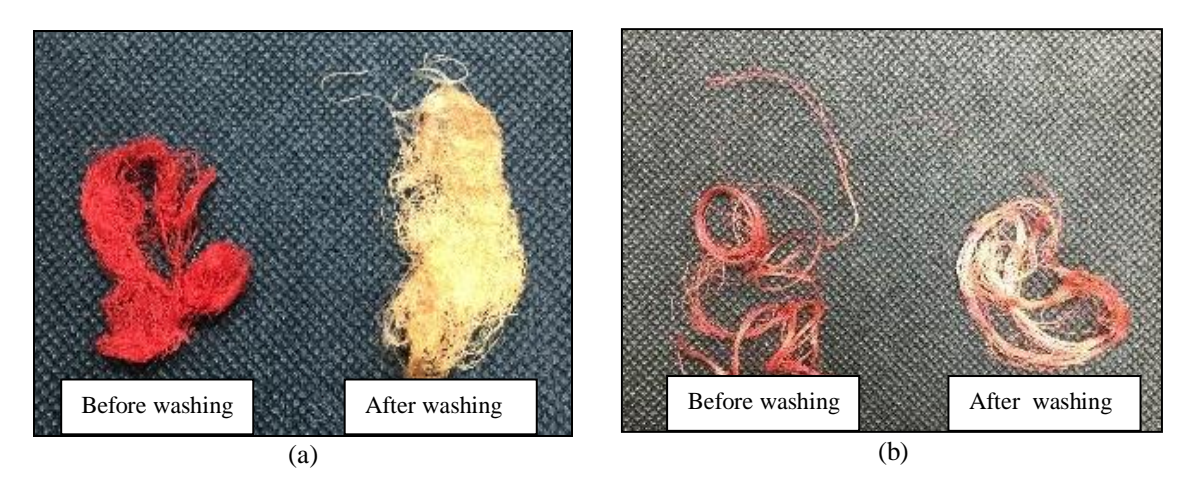
Figure 6. Colour change of pineapple leaf fibres for a) Infrared dyeing machine and b) Exhaustion dyeing machine

Fibre dyed using exhaustion dyeing yields reddish shade, while golden shade for infrared (IR) dyeing after washing as shown in Figure 6. Different shade in IR dyeing after washing process probably due to the infrared wave used although the dye is red in colour beforehand. This result gives unique colour hue of selected dye.