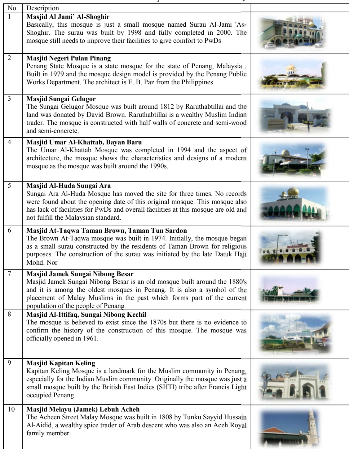
Table 1: Mosque selection for this study

There are 10 mosques that had been chosen for this study which are located in Penang island. The mosques are summarized in Table 1