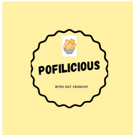
Figure 1: Logo of Pofilicious

The name of POFILICIOUS described as the name of my name and the name of this food in Malay which is called as “popia”. My purpose by choosing the name is because I would like to sell one of my favourite foods that will be an easier to make this kind of “popia”. By using a part of my name into company will make it looks authentic and easier for people to remember and pronounce it.