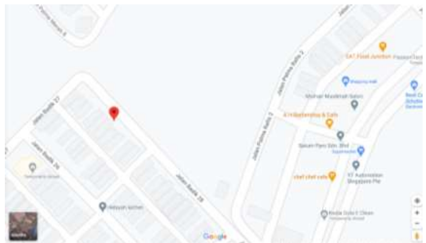
Farh's Dessert on Google Maps