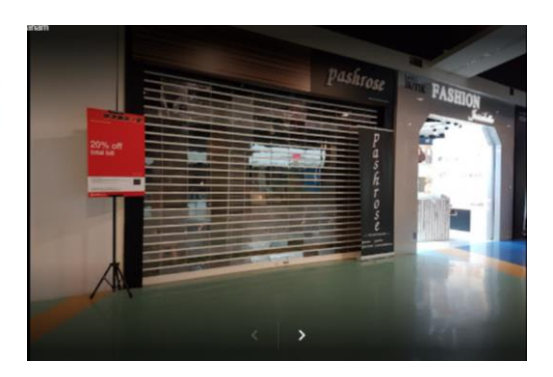
This are the location of Pashrose store.