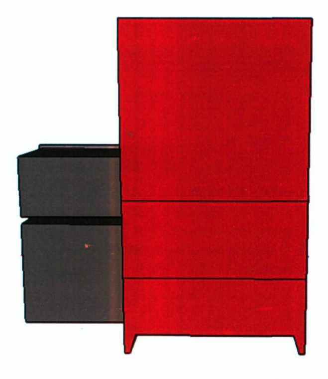
Figure 1.2: Back view