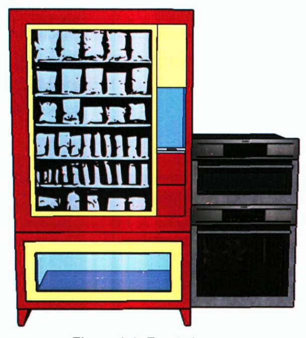
Figure 1.1: Front view

This is front view Smart Vending Machine